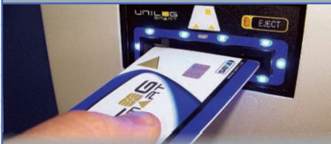
U-SMART CARD READER