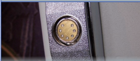
HIGH SECURITY LOCK