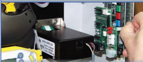
EASY TO SERVICE