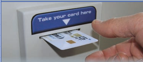
U-SMART CARD DISPENSER