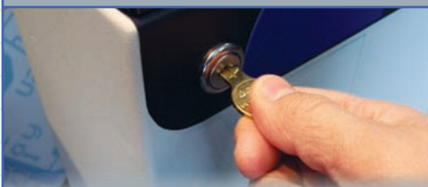
BYPASS MODE WITH LIMIT